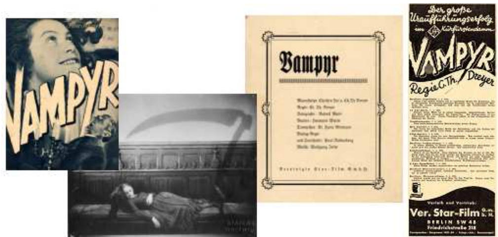
A selection of material on VAMPYR (Carl Theodor Dreyer, FR/DE 1932) available on EFG portal

The collections selected serve as examples of digitised content held in the film institutions. Around 90% of the content accessible via EFG at launch was images – film stills, set photos, posters, set drawings and portrait photographs. About 3% of the content is textual material like scripts, correspondence, film censorship visa and rulings; for print: out-of-print books, film programmes and reviews. Another 5% are actual moving images, the majority of them being newsreels, short documentaries, commercials but also selected feature films or trailers – about 22000 in all. Currently, the complex rights situation regarding film works prevents film archives from giving access to a large amount of moving images held in their stock.