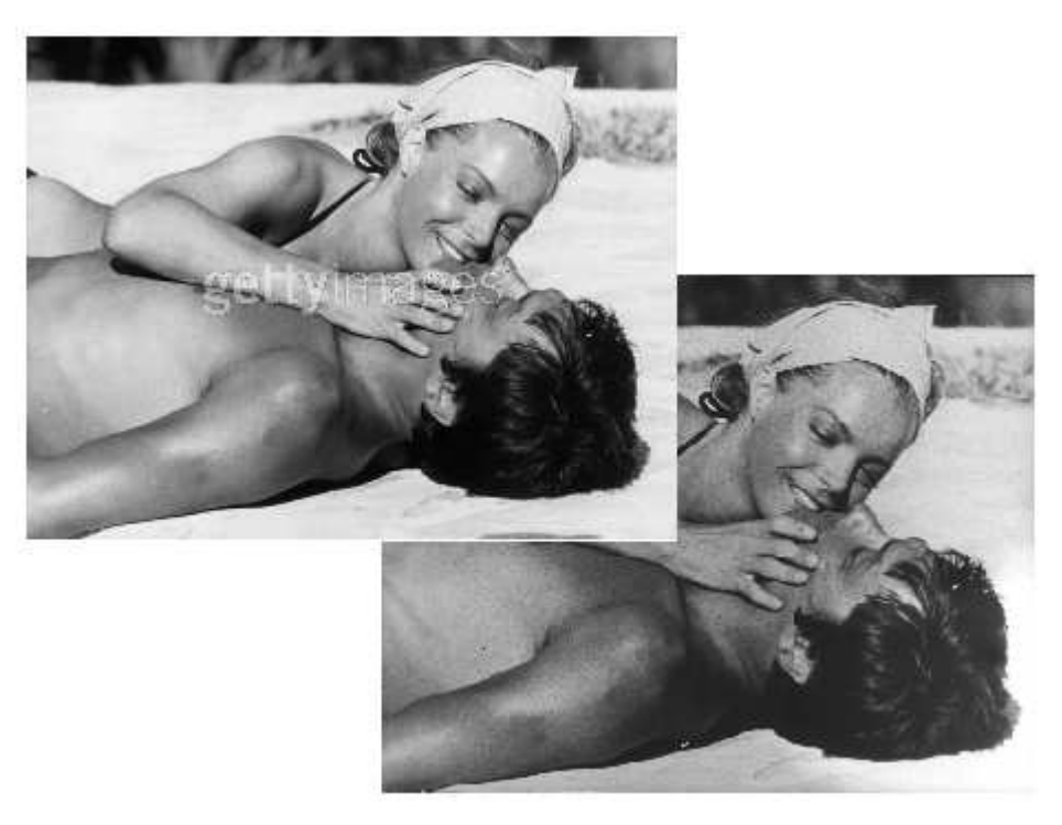
Perceptible watermark by Getty Images

Perceptible watermarks are visible to anyone who sees the watermarked items, which are often digital images. Perceptible watermarks can visibly show who the owner of a work is, and make it less attractive to commercially exploit a work at the same time. This is both the strength and the weakness of the perceptible watermark: The incentive to remove perceptible watermarks is far greater than the removal of imperceptible watermarks; visible watermarks distort the image and are visually unattractive.